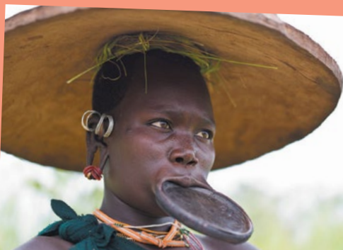
Alfred Weidinger via Wikimedia Commons

People have always had strange ideas of what it means to be beautiful and fashionable. Some think having long ears is beautiful while others think eyeballs would look much better if they were tattooed! In fact, eyeball tattooing started 2000 years ago and people are still doing it today even though there is a danger of going blind. Some people want to be beautiful and fashionable that they are willing to do dangerous things to get a kind of beauty look.